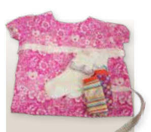
Pack D1 Girls (ages 7-10)